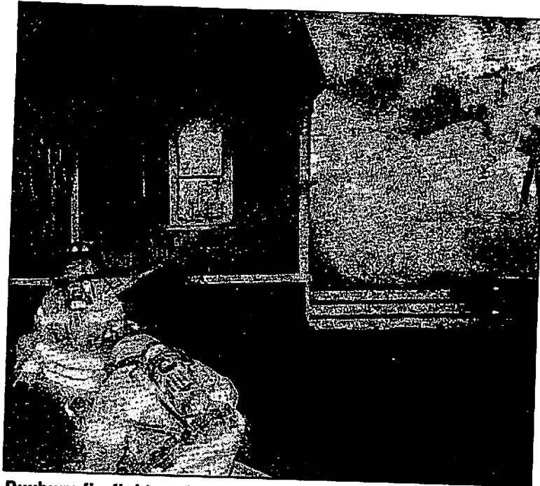
Duxbury firefighters fought Saturday's blaze with the help of Kingston and Marshfield personnel, who also responded to Standish Street.